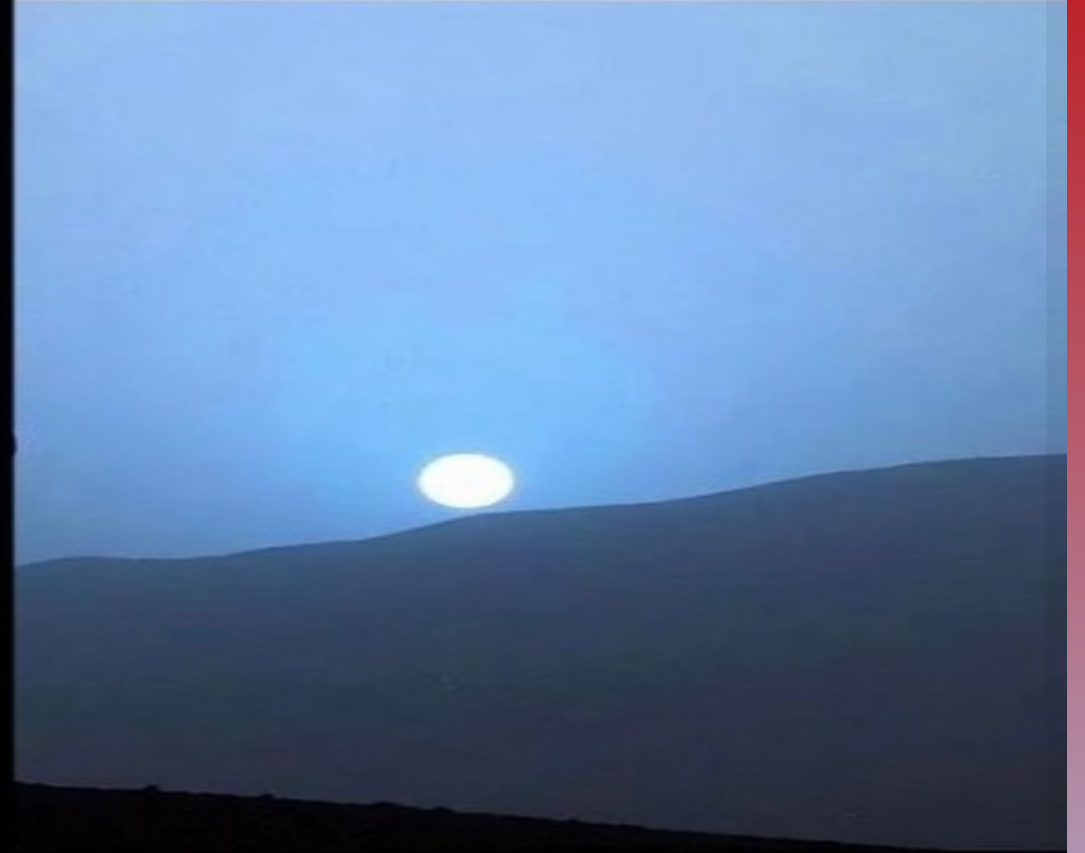
Blue sunset on Red planet