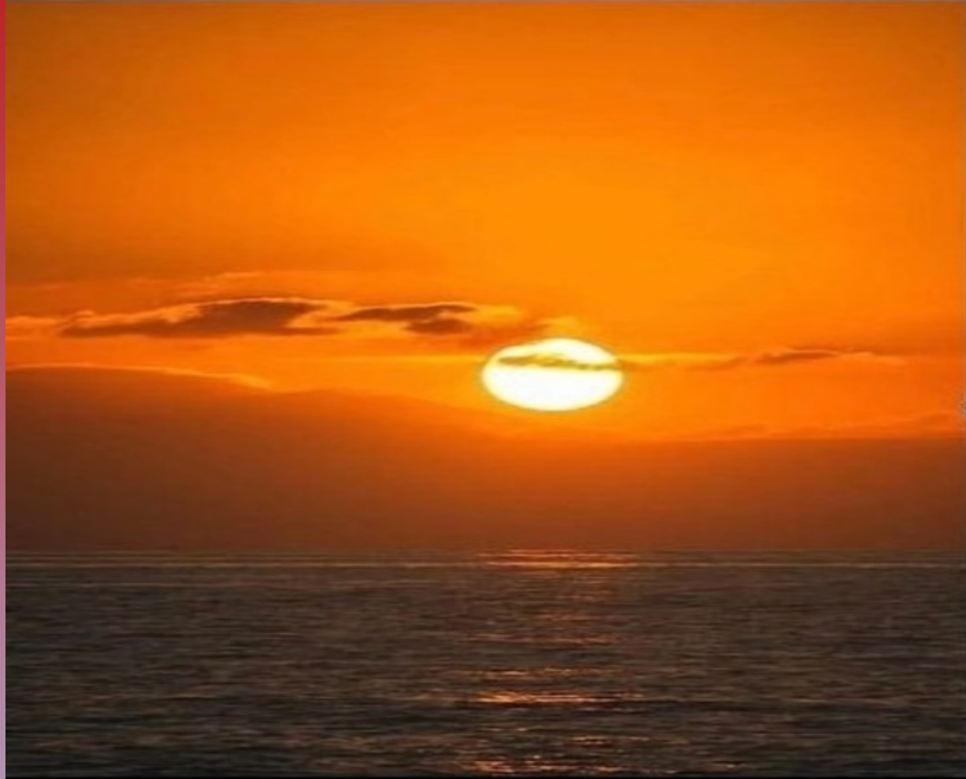
Red sunset on blue planet