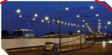
lighting the street