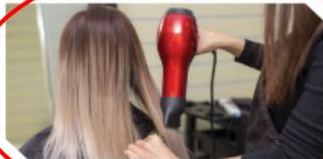
using a hairdryer