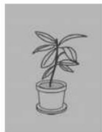
plant B: placed in a dark room

Which plant will grow more healthily? plant A Explain.